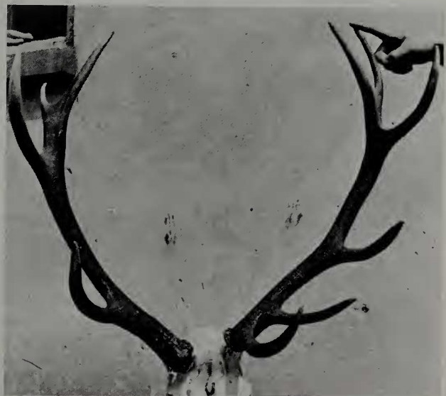
Fig. 3. Skull of red deer stag Rączy

In 1960 Rączy II started the shedding of the velvet on the left normal antler on August 5, and on the right, operated one on August 6, the